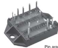
Pin arrangement see outlines